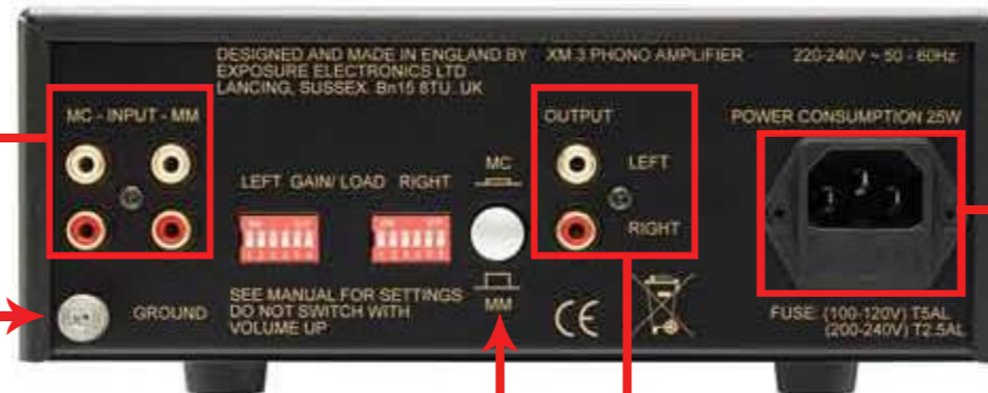
The XM3 Phono Amplifier : Rear View