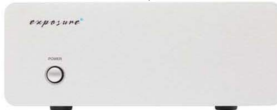
The XM3 Phono Amplifier : Front View