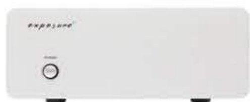
Exposure XM3 Phono Amplifier